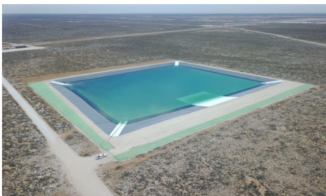
Liners & Pit Construction

Patriot Environmental, LLC is an industry innovator for fluid containment solutions. We support the domestic Oil & Gas Hydraulic Fracturing & Drilling sector and provide containment solutions to other industries nationally.